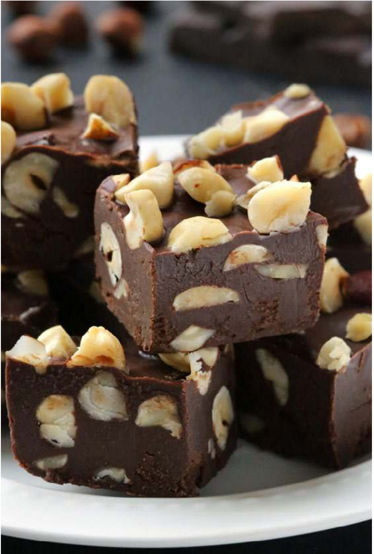
Recipe from Texanerin Baking