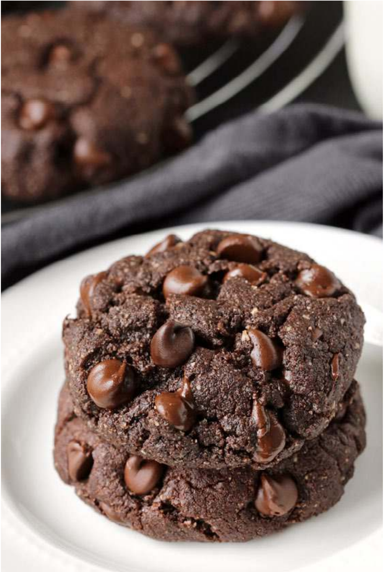
Recipe from Texanarin Baking