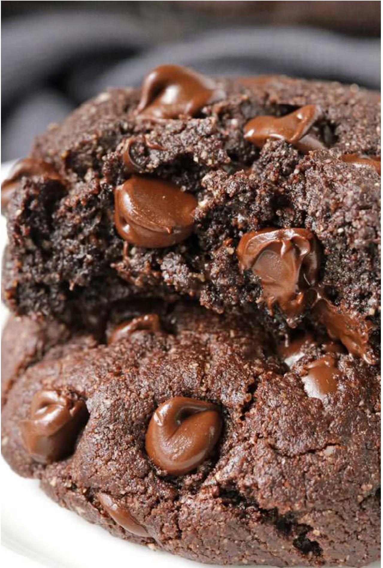
Recipe from Texanarin Baking