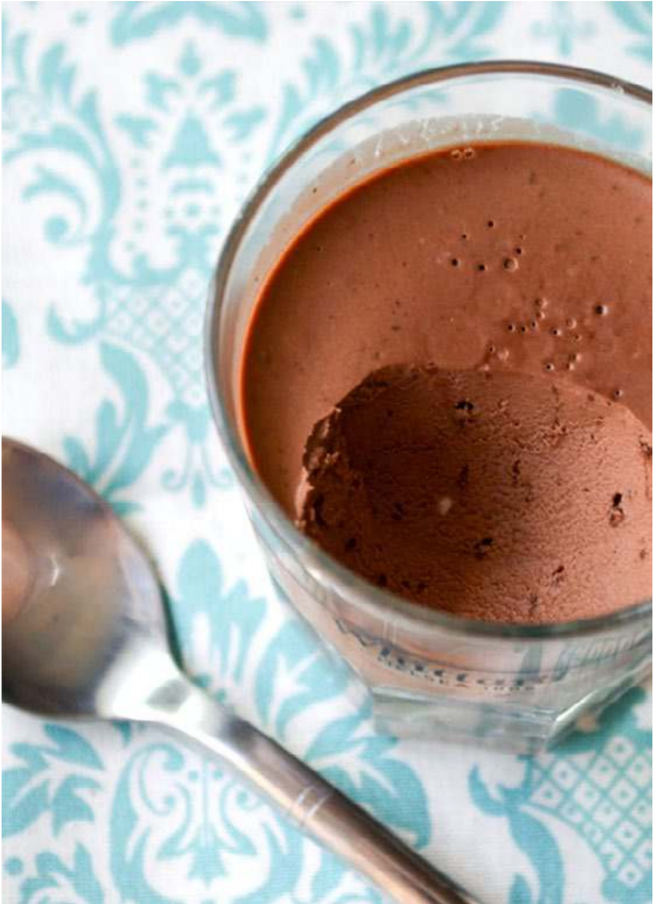
Recipe from Stupid Easy Paleo