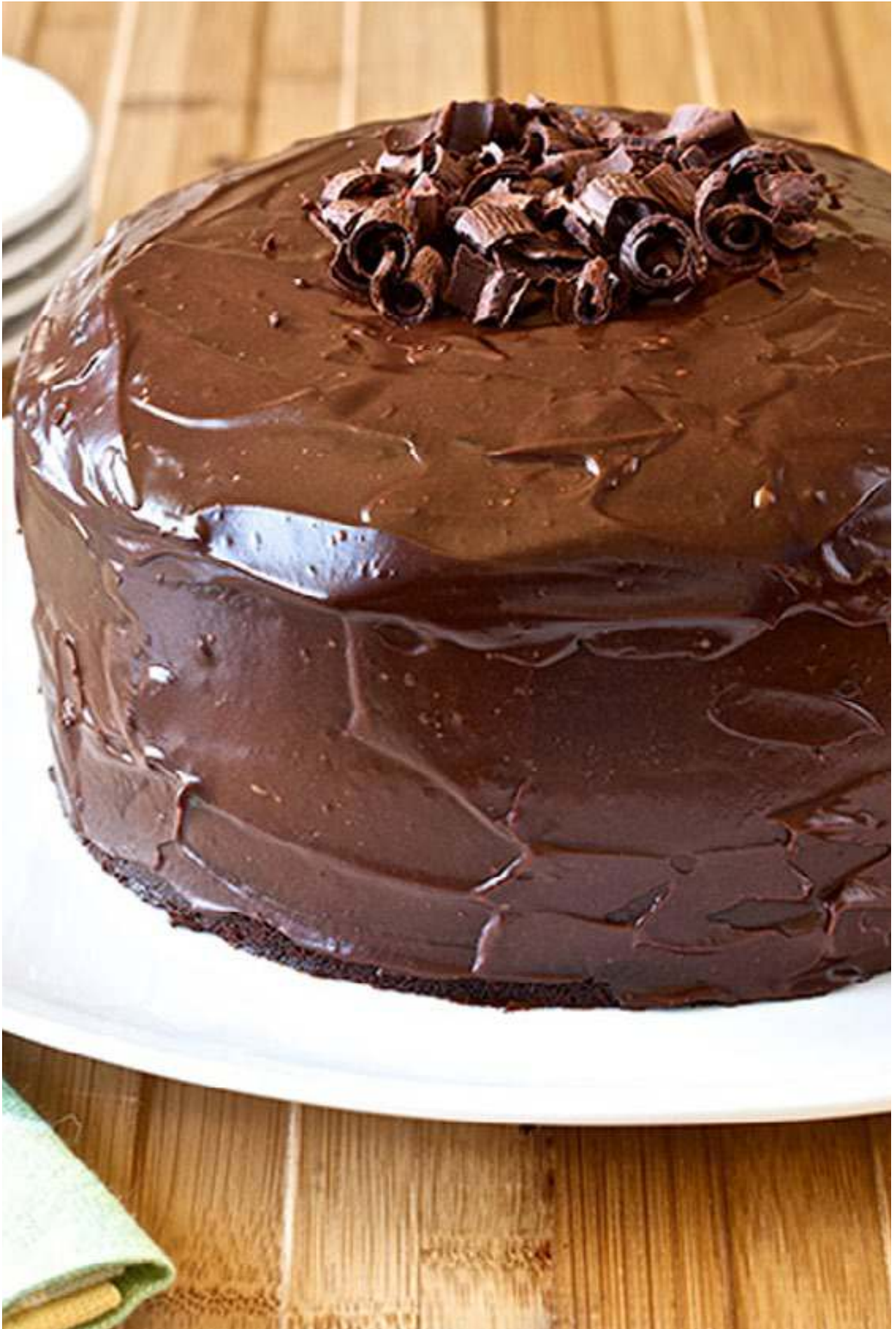
Recipe from Living Healthy With Chocolate