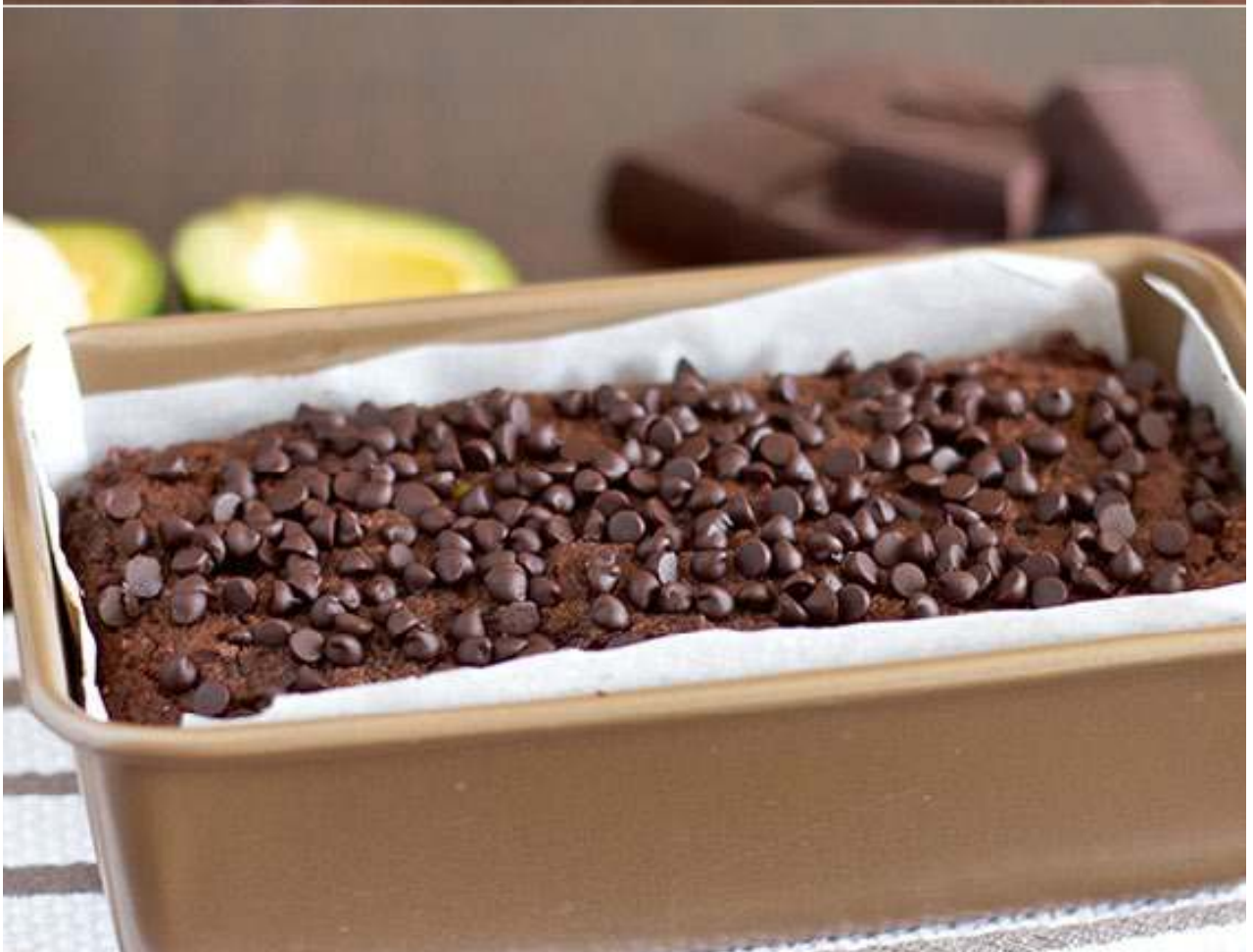
Recipe from Living Healthy With Chocolate