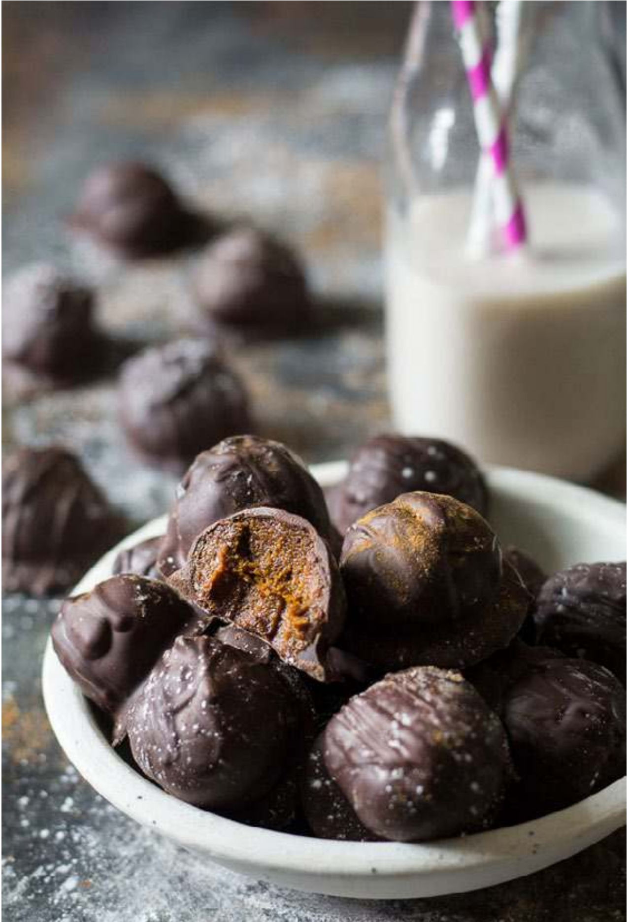
Recipe from Paleo Running Momma