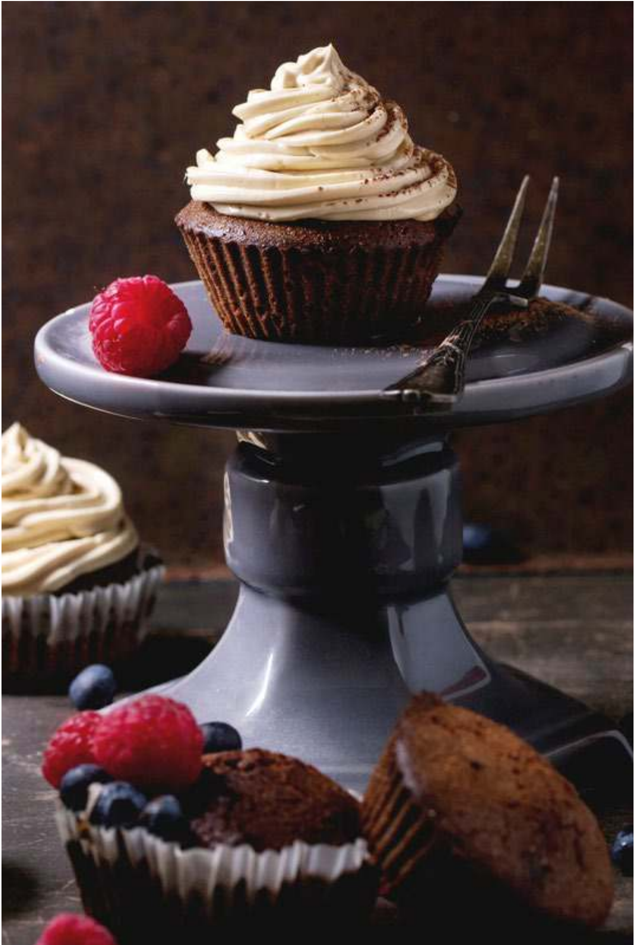
Recipe from A Girl Worth Saving