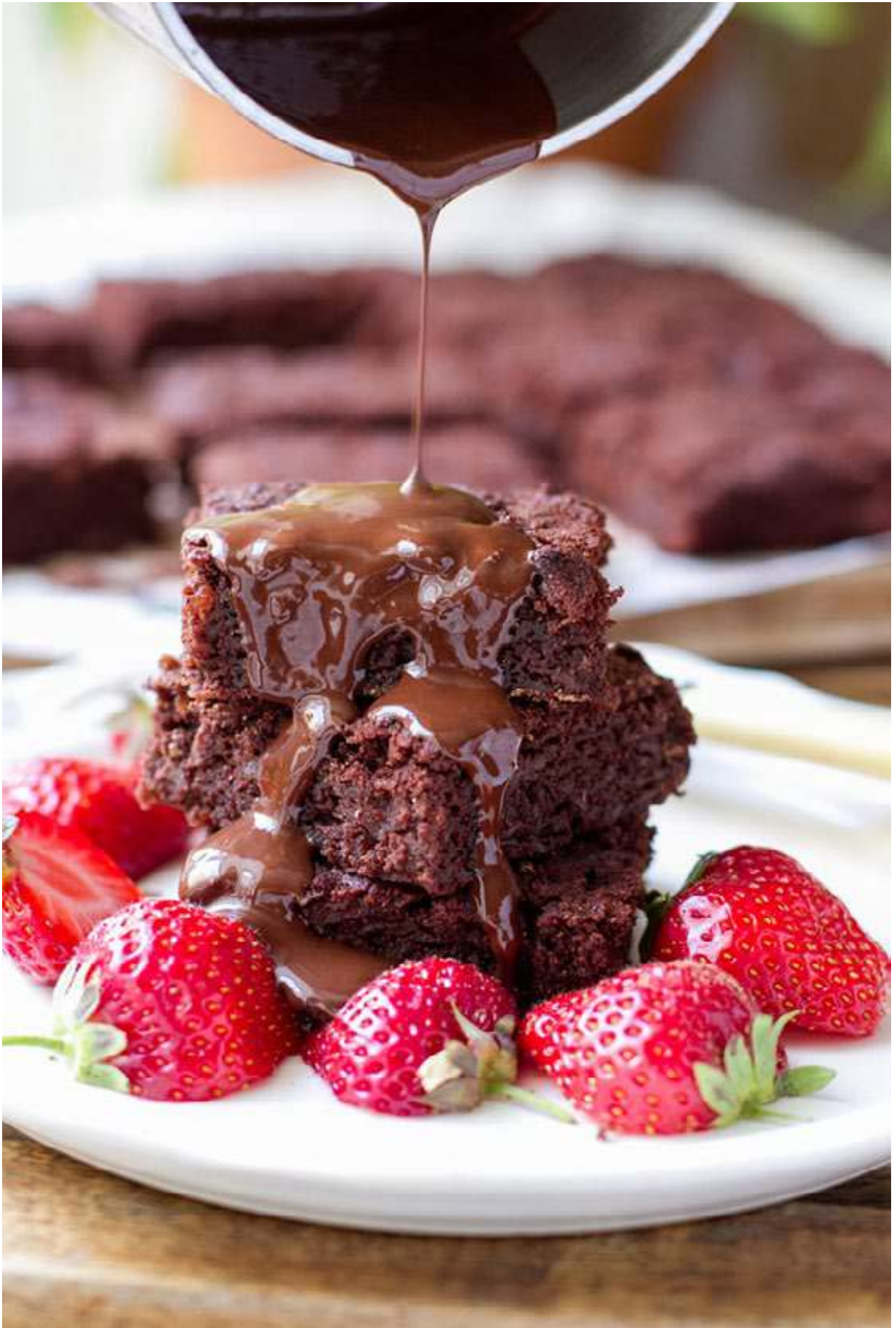
Recipe with step-by-step pics