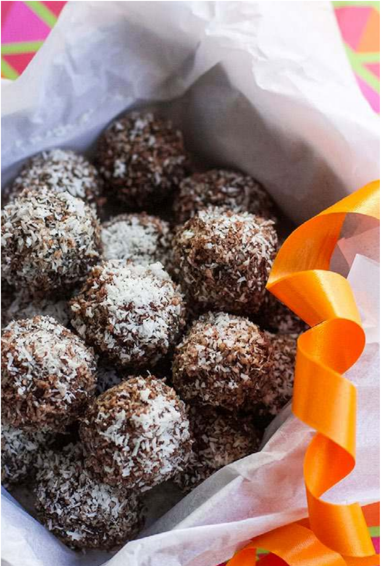
Recipe from Eat Drink Paleo